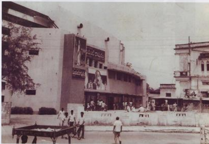
Paradise theatre in 1953

Even after all these years the brand is true to its roots!